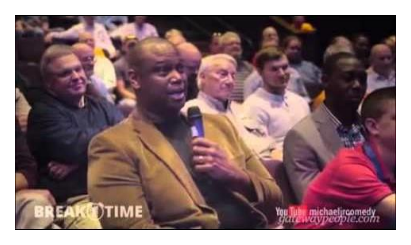
Click to Play Video