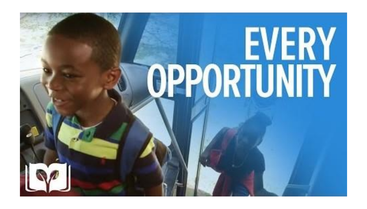
Click to Play Video